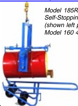
Model 185R-XO1 has optional Self-Stopping Hand Crank (shown left placing drum onto Model 160 4-Wheel Drum Truck)