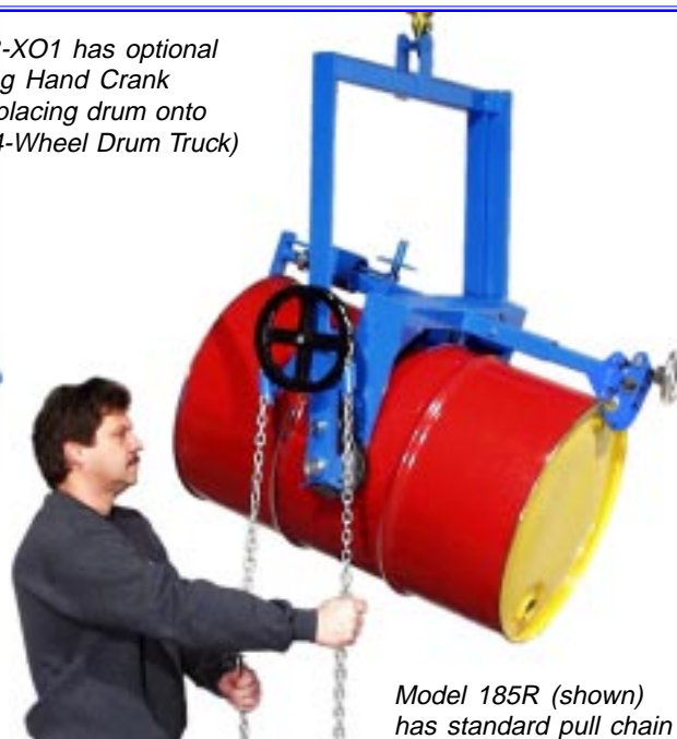
Model 185R (shown) has standard pull chain for drum tilt control