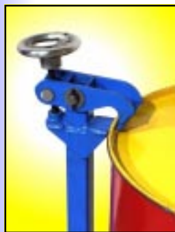
Top Rim Clamp