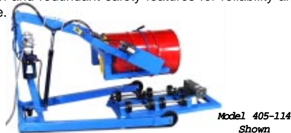
Model 405-114 Shown

The chain tightening ratchet and spring loaded pawl assembly, used to secure the drum in the saddle, has been designed with strong teeth and redundant safety features for reliability and ease of use.