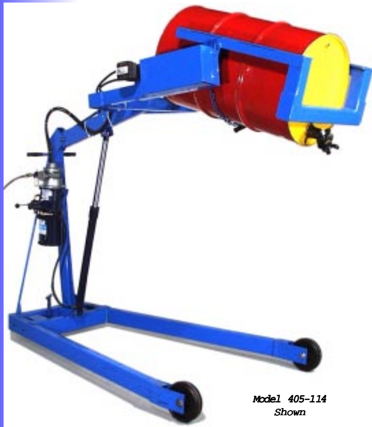
Model 405-114 Shown

Quickly and efficiently move a drum to a shelf a maximum of six feet (183 cm) high. The Omni-Lift moves easily on its two 8" (20.3 cm) wheels and two 4" (10.2 cm) casters. Clearance for 8" wheels is required under lowest shelf. Drum cradles on rack must be no wider than 16" for steel drums, or no wider than 11" for plastic drums with required adaptor (see side two).