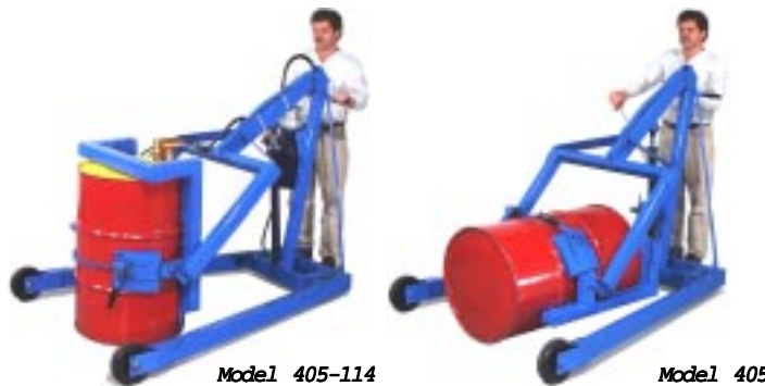
Model 405-114 Shown