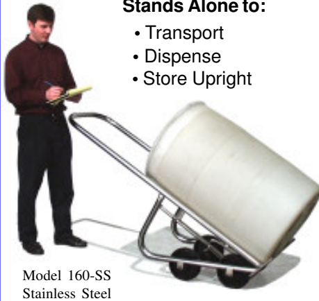
Model 160-SS Stainless Steel