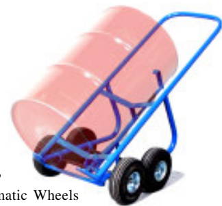
Model 160-WP with 10" Pneumatic Wheels