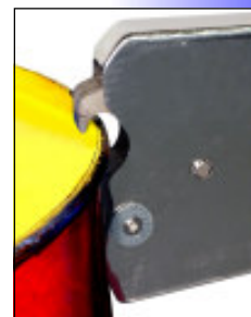
Head of Models 82HM and 82HM-124

12V DC power option includes battery and 110V AC charger.